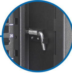
L Tower Bolt Lock Inside